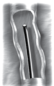
Disposable catheter inserted into vein

Although a variety of physicians offer Vein Care, be aware that vein disease is not a cosmetic problem or a disorder limited to the skin. Varicose and spider veins are often the result of an underlying disorder of the circulatory system known as venous reflux. Veins are an integral part of the circulatory system as are the heart and arteries and deserve the specialized care offered by the Cardiovascular Surgeon with the training, knowledge and experience in treating diseases of the heart and blood vessels.