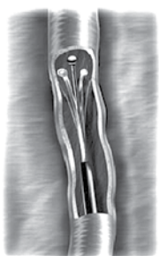
Vein warmed and collapses