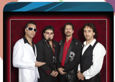
THE BONESHAKERS The BoneShakers • Main Stage Sunday, April 1 • 4:00pm