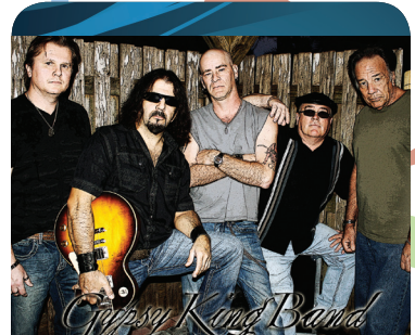
Gypsy King Band • West Stage Saturday, March 31 • 8:00pm