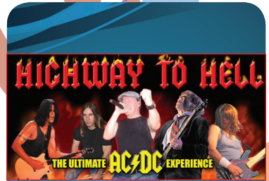
Highway to Hell, AC/DC Tribute Band Main Stage • Friday, March 30 • 8:00pm